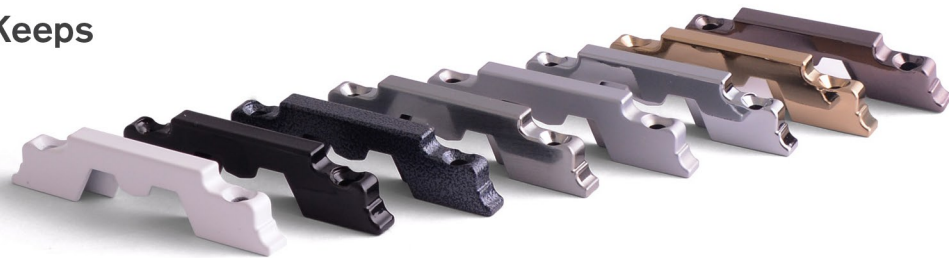
White • Black • Antique Black • Graphite • Satin • Chrome • Gold • Bronze