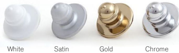
White Satin Gold Chrome