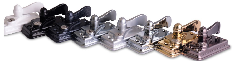
White • Black • Antique Black • Graphite • Satin • Chrome • Gold • Bronze